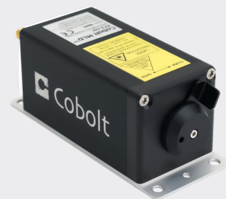
Cobolt o6 MLD laser

Until recently the most common approach would be to combine a laser with an acousto-optical modulator. Now, however, the same performance can be achieved with modulated diode lasers, which makes the set-up more compact, more robust and easier to align. “Modulated diode lasers from HÜBNER Photonics are popular for initializing and reading out spin-states because they offer fast modulation capabilities, a high on/off extinction ratio, a high level of spectral purity, as well as an excellent Gaussian beam profile” comments Waasem.