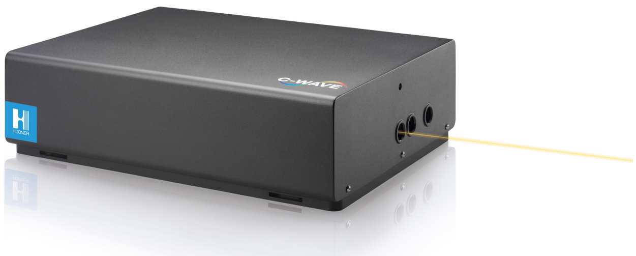
The C-WAVE from HÜBNER Photonics combines wide tunability with a narrow linewidth needed and a higher spectral purity than equivalent tunable lasers.

Quantum researchers have been quick to recognize the benefits of continuous-wave OPOs for assessing the potential of different single-photon emitters. For example, scientists from the USA, Germany, China, Singapore, and Japan have exploited the C-WAVE platform to measure the photoluminescence spectra from silicon, germanium and tin vacancy centres in diamond, none of which suffer from the same sensitivity to electric field as nitrogen defects.