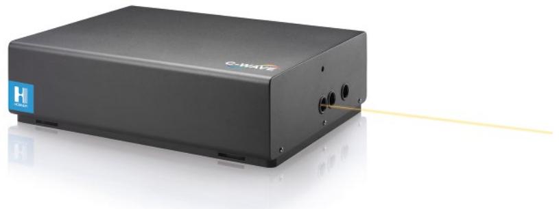
The C-WAVE from Hübner Photonics combines wide tunability with a narrow linewidth needed and a higher spectral purity than equivalent tunable lasers.

Over the last few years, however, improved design techniques have yielded more sophisticated and more efficient nonlinear materials, such as periodically-poled lithium niobate, that can be phase-matched to the pump laser. A new generation of continuous-wave lasers also provides higher pump powers across the frequency spectrum, making it possible for the first time to produce widely tunable cw OPOs in a turnkey system that delivers narrow-linewidth output at powers levels of a few hundred milliwatts [1].