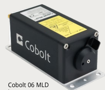
Cobolt 06 MLD laser

tializing and reading out spin-states because they offer fast modulation capabilities, a high on/off extinction ratio, a high level of spectral purity, as well as an excellent Gaussian beam profile,” comments Niklas Waasem, laser physicist at Hübner Photonics.